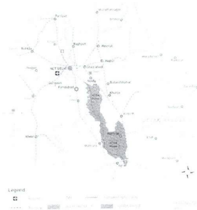
Figure 1: The YEIDA Region